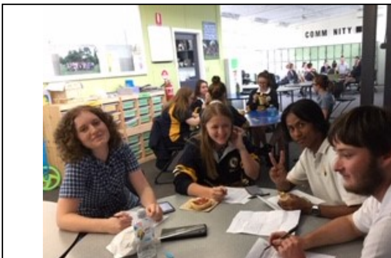
VCE Leadership Team

As for a flying start to the school year – it certainly has been, and we are keen to keep the momentum going!